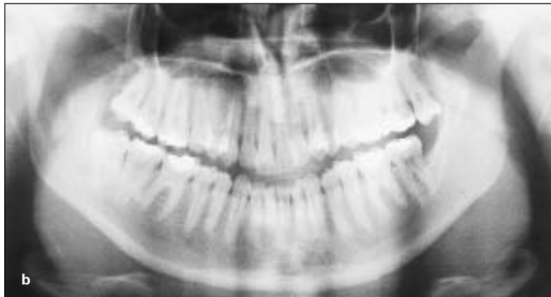
Fig 3 Patient at 22 years of age. (a) At maximal opening, showing a slight deviation to the left side. (b) OPG showing normal anatomy of the condyle on the left side. The condyle on the right side is observed to be of reduced size.