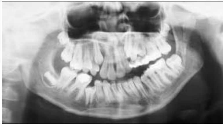
Fig 2 Patient at 9 years of age. OPG shows a situation similar to that shown in Fig 1b. Note the carious first mandibular molars have been restored.